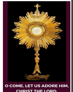
O COME, LET US ADORE HIM, CHRIST THE LORD.

If possible, please sign up when you can be at Adoration. The sign-up sheet is on the podium at the entrance of church. If you cannot commit to a time, please come when you can. Jesus will be waiting for you !